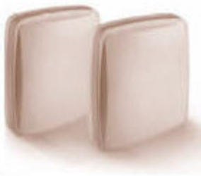
Tsunami QuickBridge II

Furthermore, Tsunami MP.11 5054-R offers industry leading features e.g., IEEE 802.16e based on WiMAX QoS, mobile roaming, routing, and bridging capability, asymmetric bandwidth management, management through a Web interface, a Command Line Interface (CLI), or Simple Network Management protocol (SNMP), optional integrated antenna, and VLAN support.