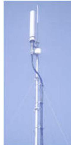
Tsunami MP.11 mounted on poles

China Netcom Gansu conducted many onsite trails to identify the wireless solution that would provide best services to their customers. Proxim's pioneering wireless solutions proved to be the best that can really meet the services and applications requirements of China Netcom Gansu customers. Hence they selected Proxim Wireless WiMAX, mesh, and backhaul products to build the most cost-effective wireless data and voice network in the country. China Netcom Gansu deployed the following Proxim end-to-end products: