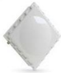
Tsunami MP.11 5054-R

China Netcom Gansu selected the Tsunami MP.11 5054-R as the backhaul for mesh access points as it can support voice, data and video applications. Using advanced OFDM technology and Wireless Outdoor Routing Protocol (WORP), MP.11 networks dynamically adapt to the ever-changing network load for optimum performance. WORP adapts to avoid collisions and maximizes data content with each transmission. The performance of MP.11 5054-R fulfilled the requirements of China Netcom customers.